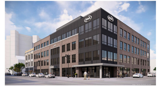
430 Re-Development - $21M Anticipated Completion Winter 2020