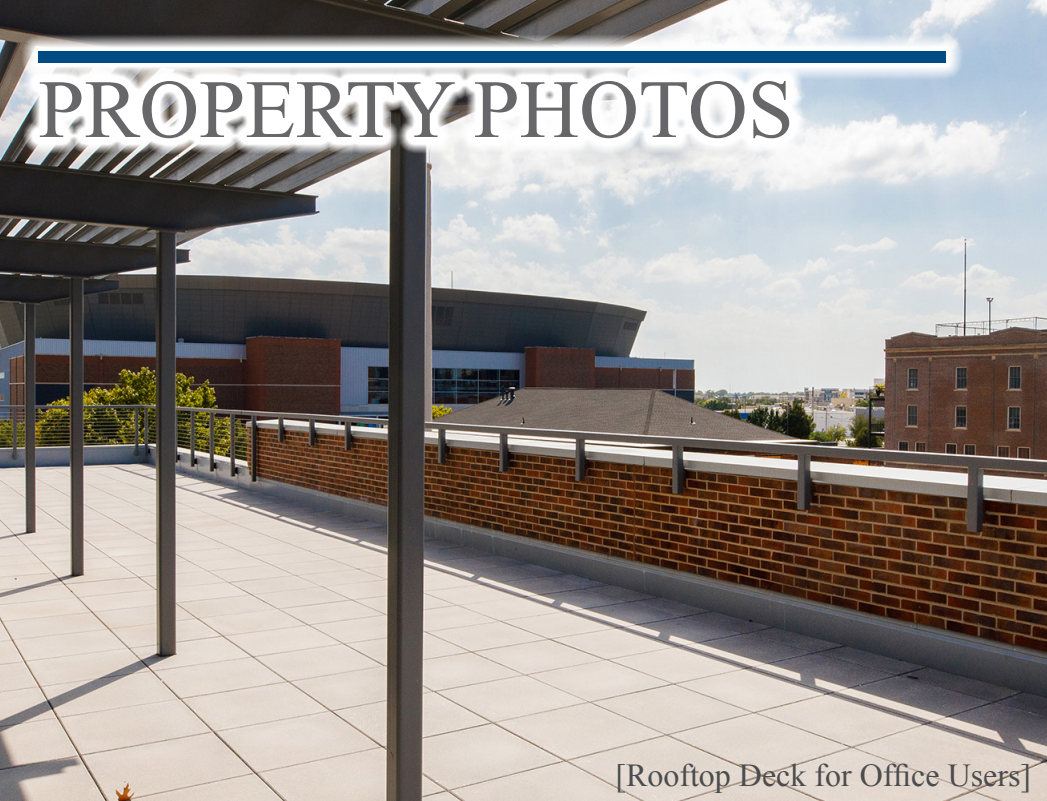
[Rooftop Deck for Office Users]