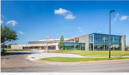
Advanced Learning Library - $30M