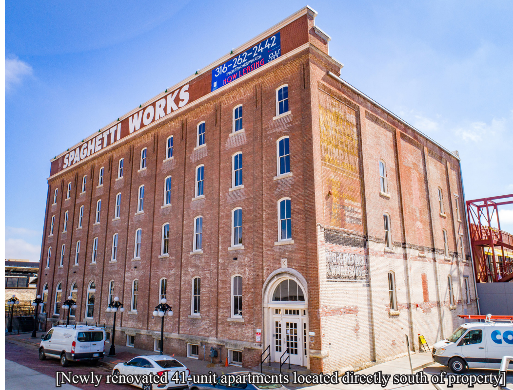
[Newly renovated 41-unit apartments located directly south of property]