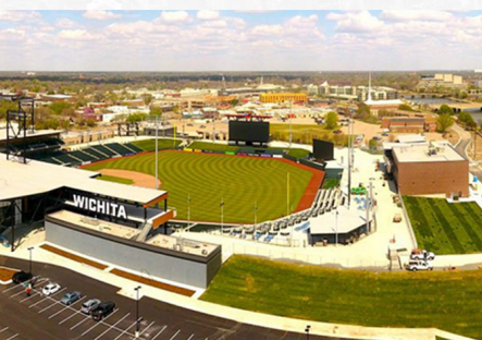
Riverfront Stadium - $75 Million