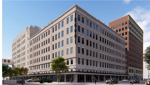
Kansas Health Science Center - $75M Anticipated Completion 2022