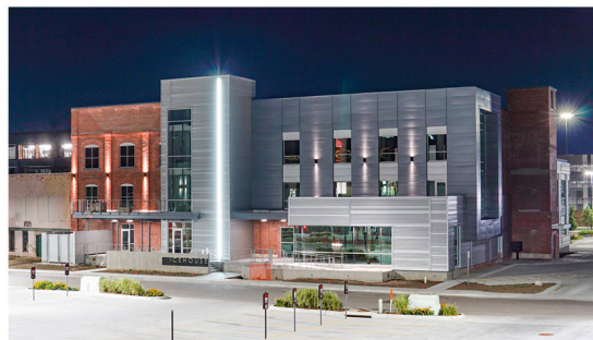
The Ice House Re-Development