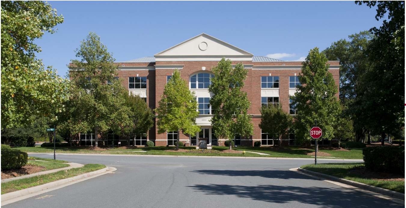
10800 Sikes Place

Providence Park Providence Road at I-485 - Charlotte, NC