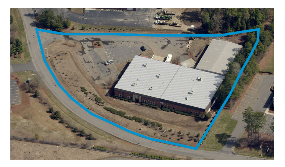
*Landlord has plans and a quote to add a normal hazard sprinkler system with the current quoted rate.