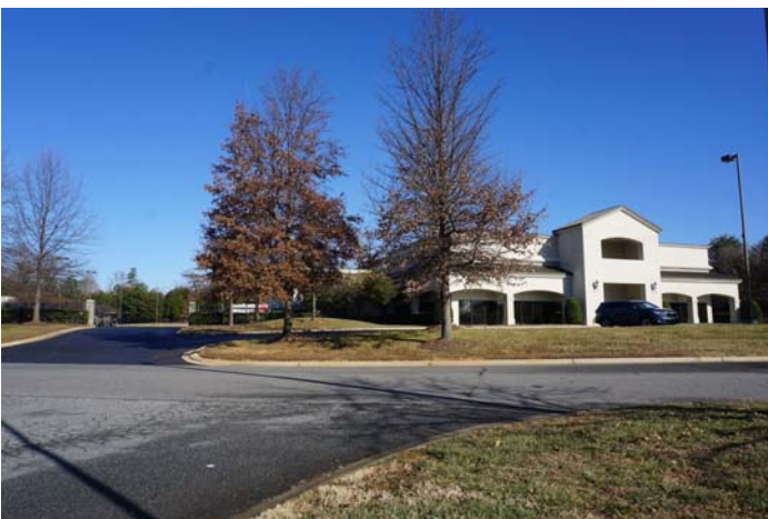
2 driveway entrances