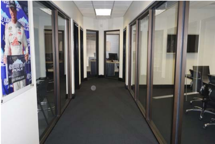
high image office build-out