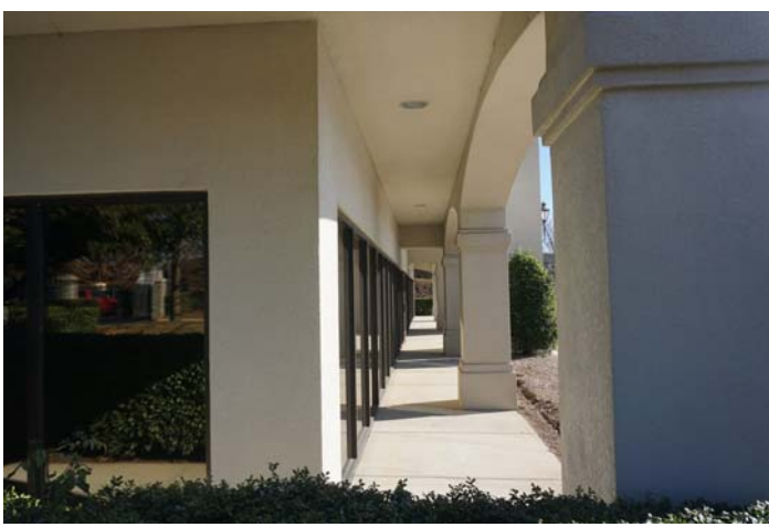
full length glass windows