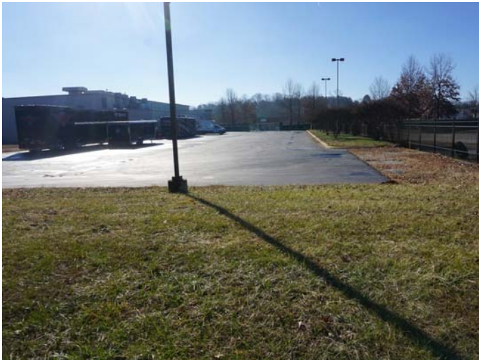
large parking lot-entire 3.02 acres is fenced