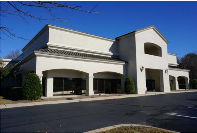
architecturally designed front