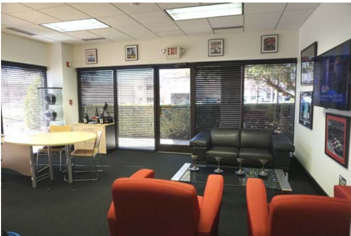
corner office with private entry