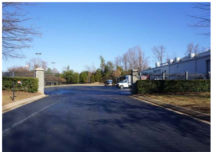
security gate & entire property fences