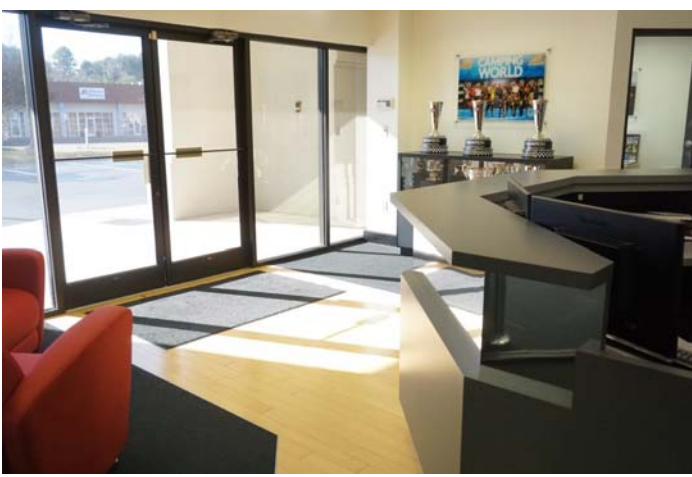
reception and waiting