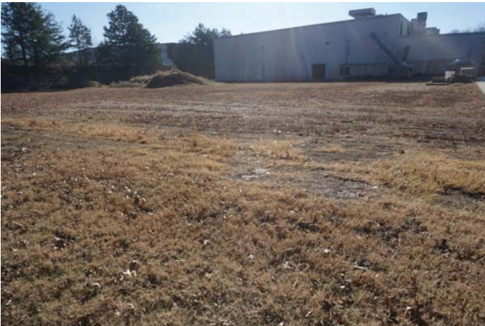
extra land for parking or future expansion