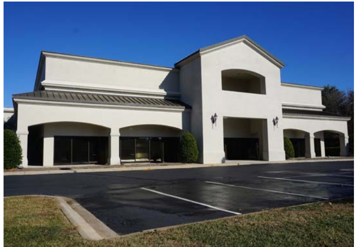
26,500 SF industrial/office