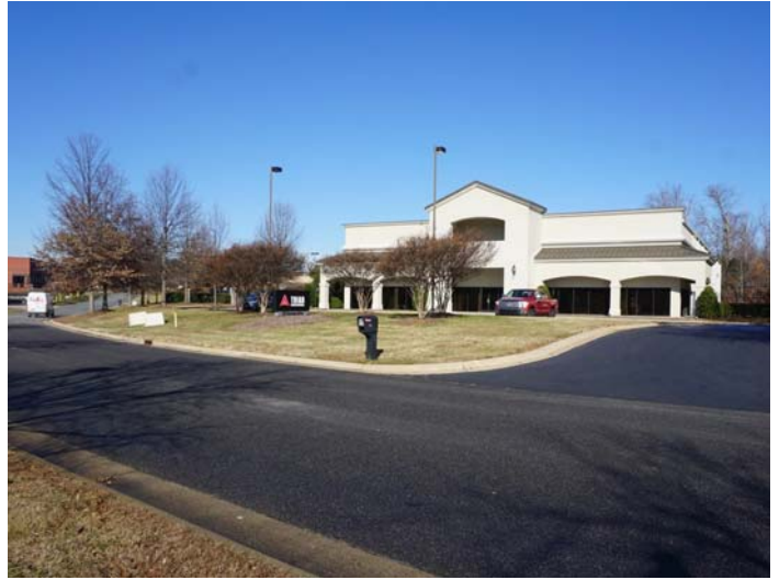
located in business park