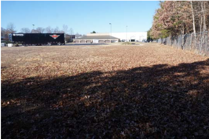
extra land for parking or future expansion