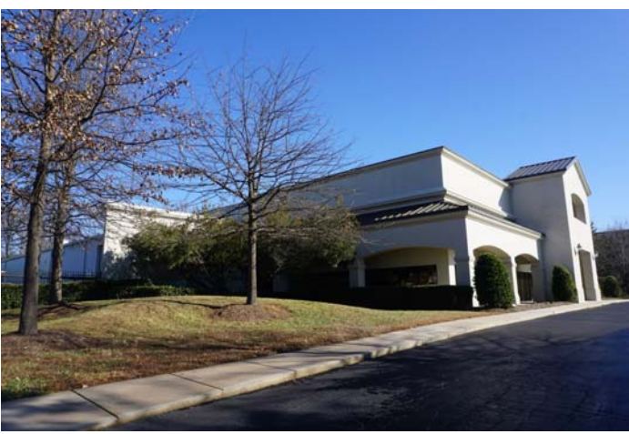
26,500 SF industrial/office