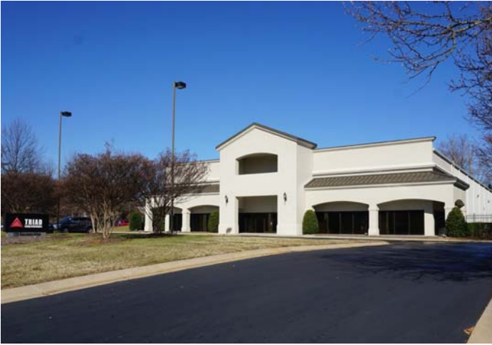
industrial/office building-many possible uses!