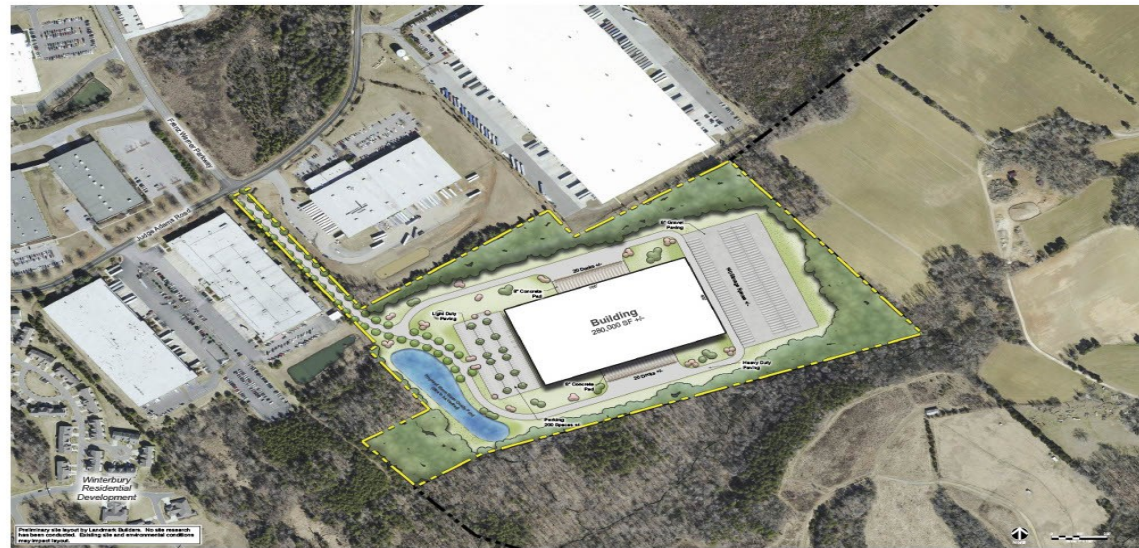
Concept 1 (280K) Rock Creek Lot 25 Guilford County, NC