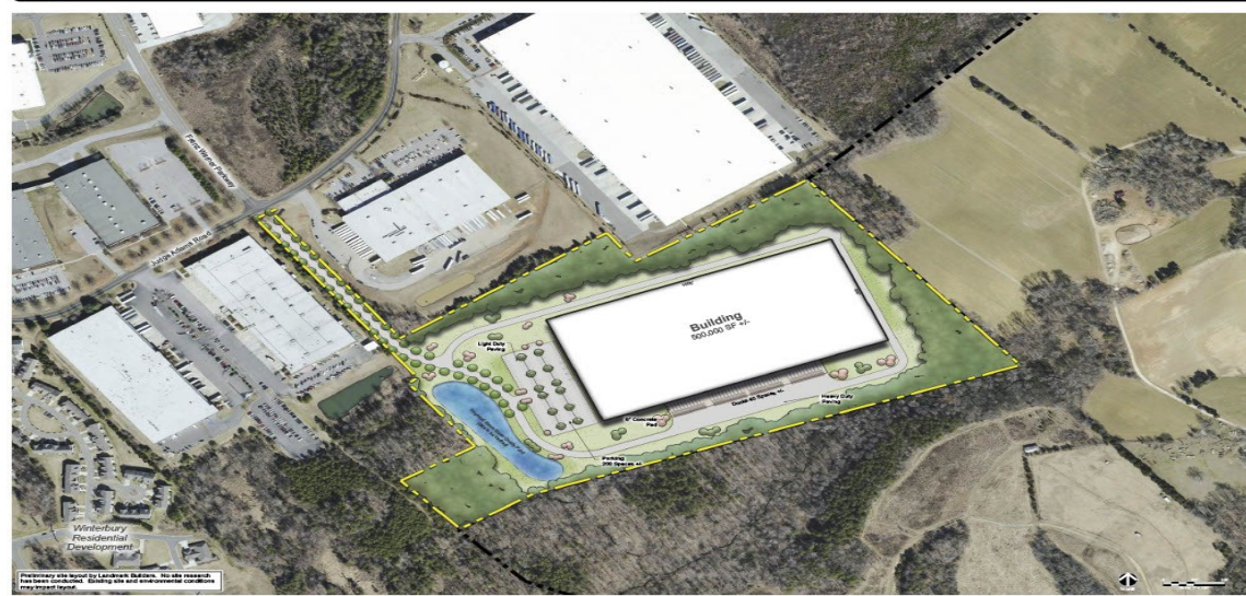
Concept 2 (500K) Rock Creek Lot 25 Guilford County, NC