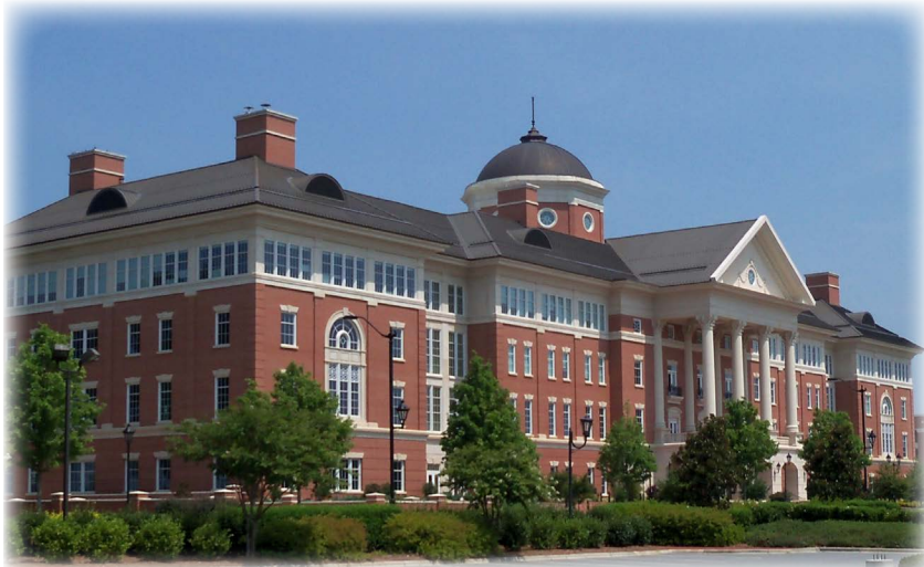
David H. Murdock Research Institute