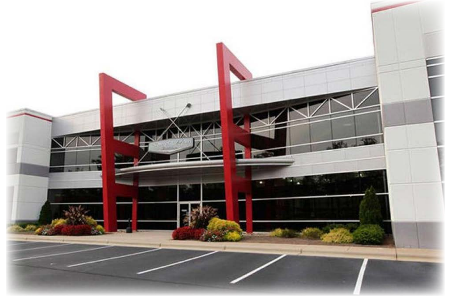
Stewart Haas Racing

Approximately 20 miles northeast of the City of Charlotte, Kannapolis is located in the counties of Cabarrus and Rowan. The name, Kannapolis, comes from Cannon Mills Corporation with early variations of the name being Cannon-opolis or Cannapolis. Today, Kannapolis is the 20th largest city in North Carolina and is home to the Kannapolis Intimidators, the Class A affiliate of the Chicago White Sox and Stewart-Haas Racing, located just across Kannapolis Parkway from the available site. Recent years have seen a revitalization of the Downtown area that now includes numerous shops, restaurants and events throughout the year.