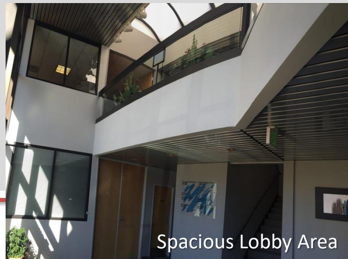
Spacious Lobby Area