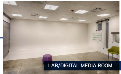
LAB/DIGITAL MEDIA ROOM