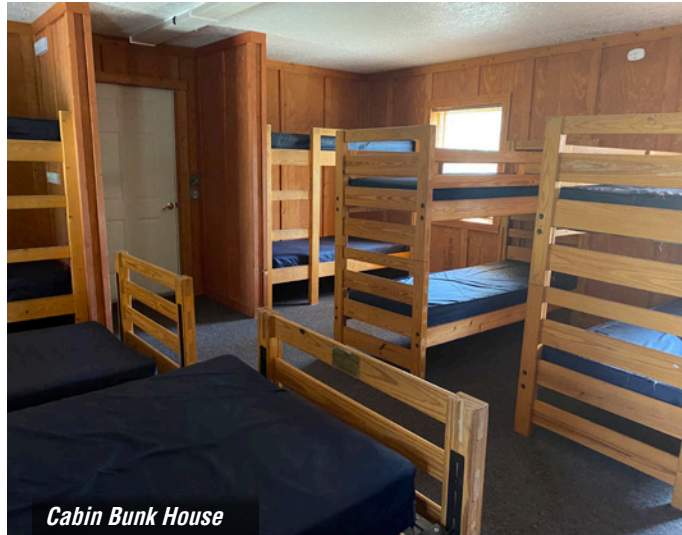
Cabin Bunk House