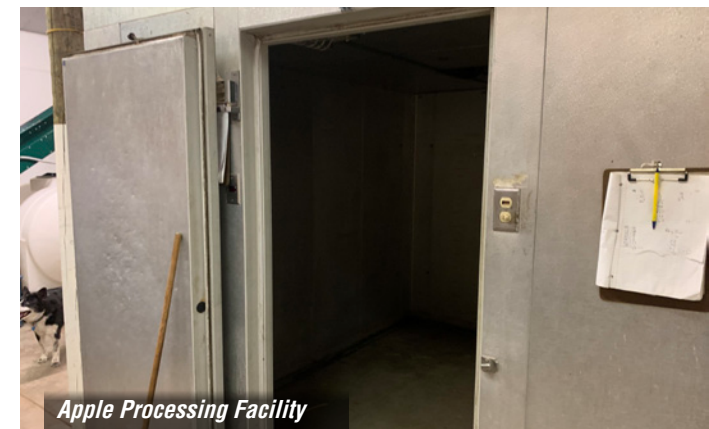
Apple Processing Facility