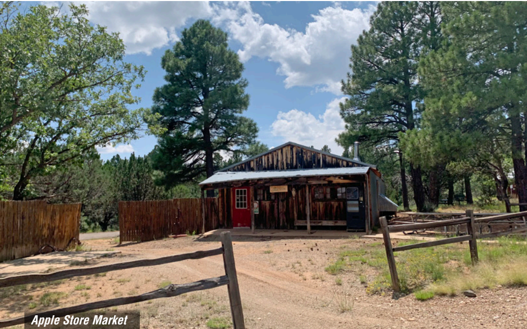
Apple Store Market