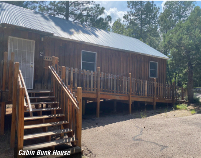
Cabin Bunk House