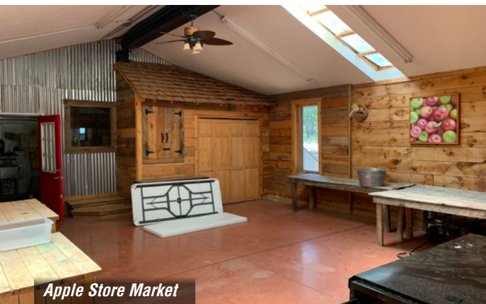
Apple Store Market