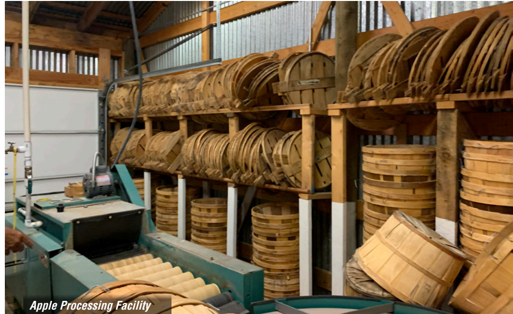
Apple Processing Facility