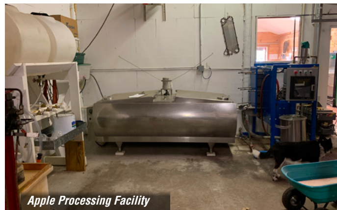
Apple Processing Facility