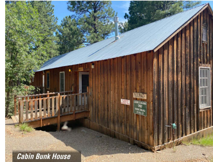
Cabin Bunk House